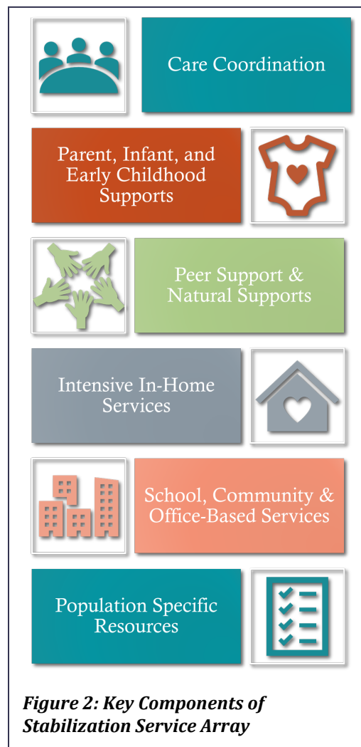
Figure 2: Key Components of Stabilization Service Array

When considering, selecting, and referring a youth and family to services, including evidence-based practices † , providers should consider the cultural humility and linguistic competency of programming and the fit of the intervention with the strengths, needs, and goals of the youth and family. State and localities are encouraged to adopt consistent training for all providers serving children, youth, and families. In addition to training on child and youth development, the adolescent brain, and trauma-responsive systems, communities can provide training on how data can inform continuous quality improvement; workforce development to eliminate the use of seclusion and restraint; how to establish a performance improvement team with non-tokenized roles for youth and families; and the importance of youth- and family-centered care, respect, and dignity. Family, youth, and other team members should be active participants in making decisions about the transition from stabilization services to ongoing services.